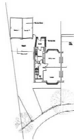
Site plan 1:500 scale